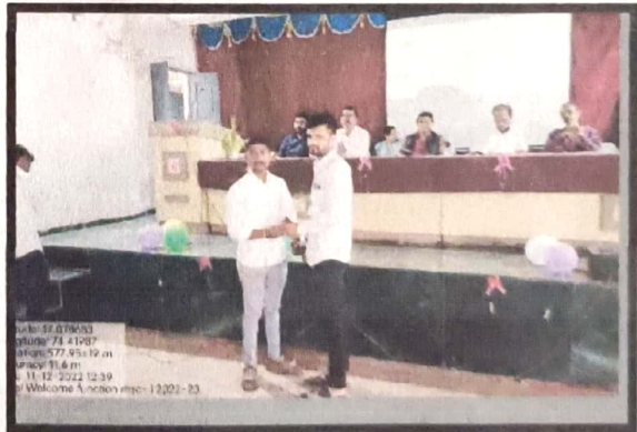
Some photograph's of Welcome of M.Sc.-I by M.Sc.-II